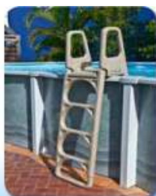
Moulded Resin Ladder