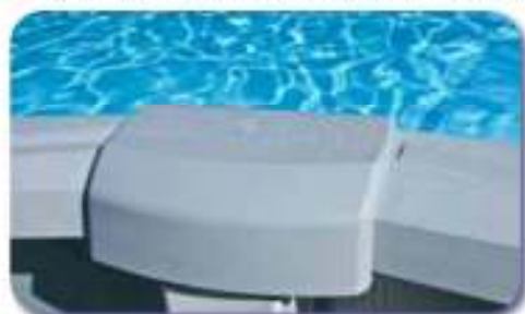
Stylish Resin Coping Connectors