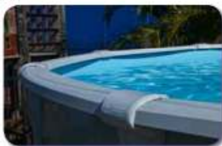
Deluxe 160mm Curved Injection Moulded Resin Copings