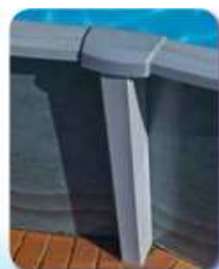
Super Strength Braceless Framework