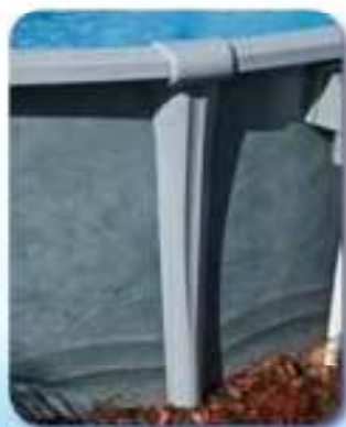
Stylish Resin Uprights